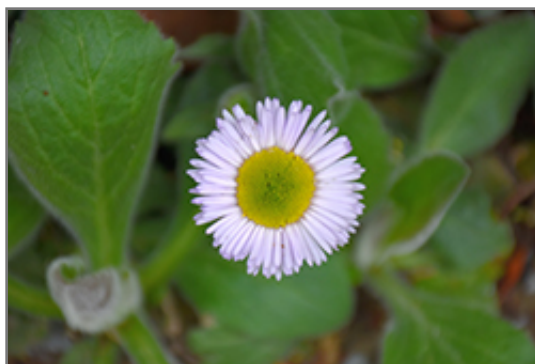
Lynnhaven Carpet Fleabane flowers