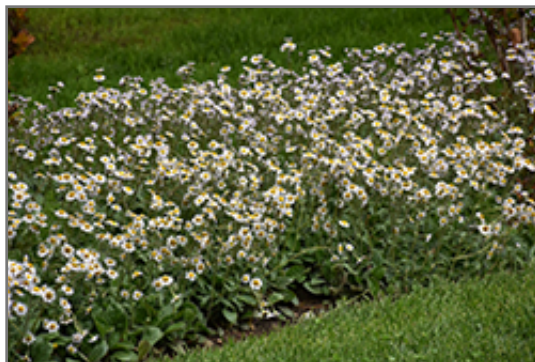
Lynnhaven Carpet Fleabane in bloom