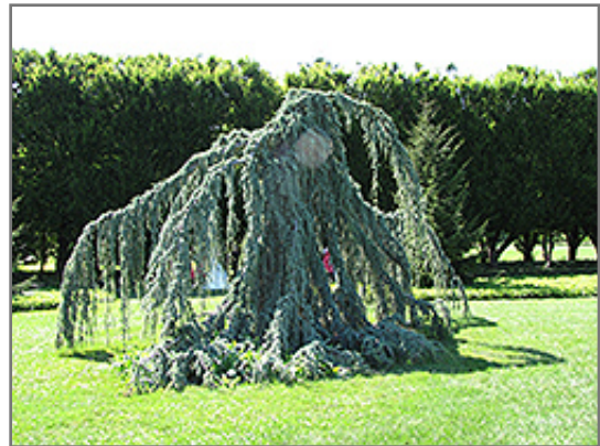
Weeping Blue Atlas Cedar