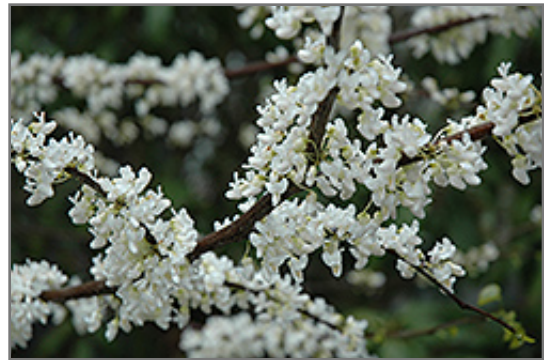
White Redbud flowers