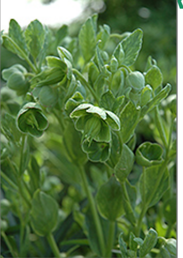
Stinking Hellebore flowers

Chartreuse colored buttercup-type blooms and glossy blue-green foliage; one of the first flowers to come up in cool weather and what a beautiful harbinger they are; great in woodland gardens and on shaded slopes