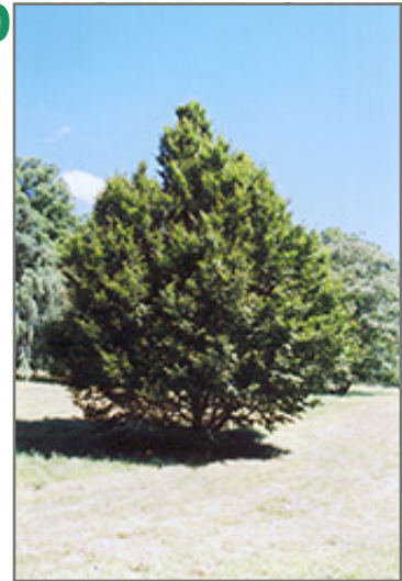
American Hornbeam