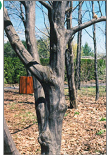
American Hornbeam bark