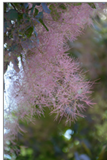
Royal Purple Smokebush flowers