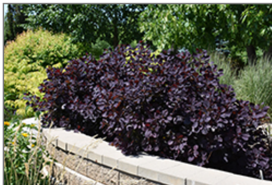
Royal Purple Smokebush