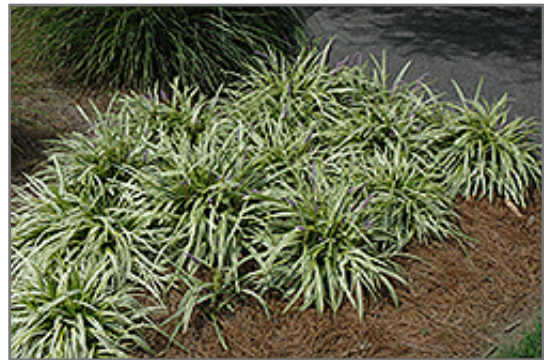
Variegata Lily Turf in bloom