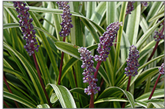
Variegata Lily Turf flowers