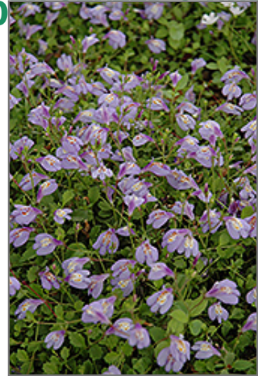
Creeping Mazus flowers