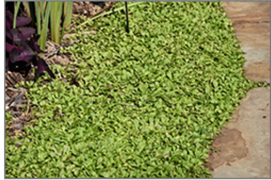
Creeping Mazus

Creeping Mazus is a fine choice for the garden, but it is also a good selection for planting in outdoor pots and containers. Because of its spreading habit of growth, it is ideally suited for use as a 'spiller' in the 'spiller-thriller-filler' container combination; plant it near the edges where it can spill gracefully over the pot. Note that when growing plants in outdoor containers and baskets, they may require more frequent waterings than they would in the yard or garden.