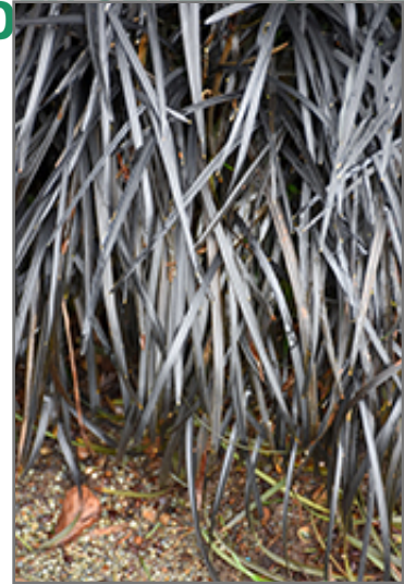
Black Mondo Grass foliage

Black Mondo Grass is a fine choice for the garden, but it is also a good selection for planting in outdoor pots and containers. It is often used as a 'filler' in the 'spiller-thriller-filler' container combination, providing a mass of flowers and foliage against which the thriller plants stand out. Note that when growing plants in outdoor containers and baskets, they may require more frequent waterings than they would in the yard or garden.