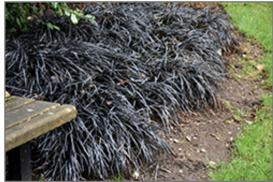
Black Mondo Grass