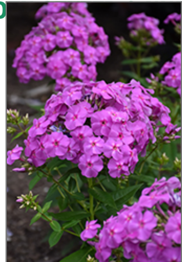
Flame Lilac Garden Phlox flowers