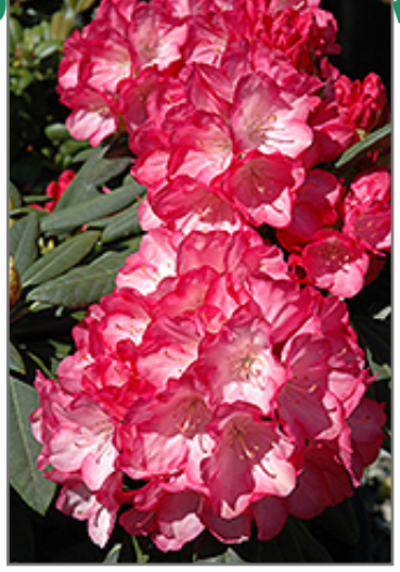
Fantastica Rhododendron flowers

Fantastica Rhododendron is covered in stunning clusters of lightly-scented hot pink trumpet-shaped flowers with white throats at the ends of the branches in mid spring. It has dark green evergreen foliage. The narrow leaves remain dark green throughout the winter.