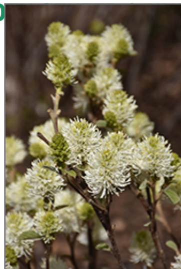
Mt. Airy Fothergilla flowers