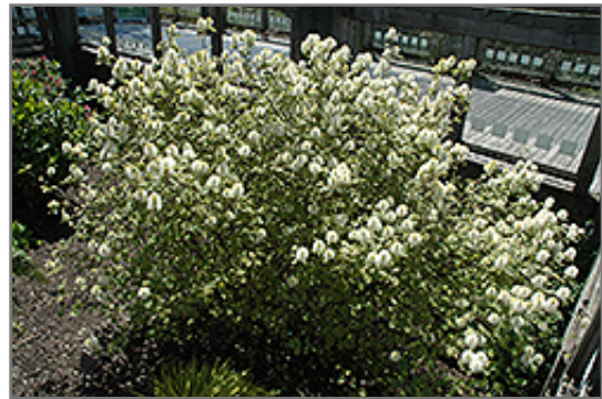
Mt. Airy Fothergilla in bloom