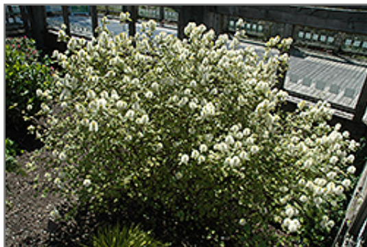
Mt. Airy Fothergilla in bloom