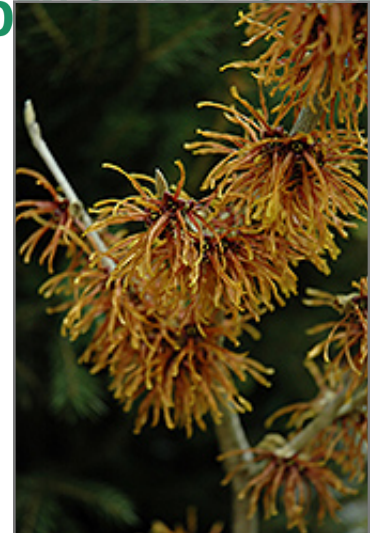
Jelena Witchhazel flowers