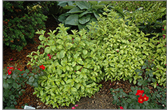
Ghost Weigela

This shrub should only be grown in full sunlight. It prefers to grow in average to moist conditions, and shouldn't be allowed to dry out. It is not particular as to soil type or pH. It is highly tolerant of urban pollution and will even thrive in inner city environments. This is a selected variety of a species not originally from North America.