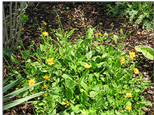
Sunshine Superman Tickseed in bloom