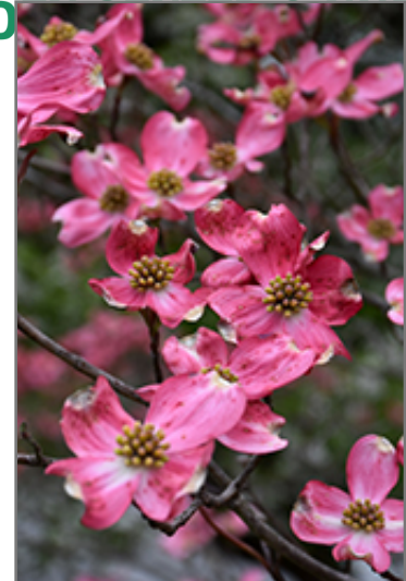
Cherokee Chief Flowering Dogwood flowers