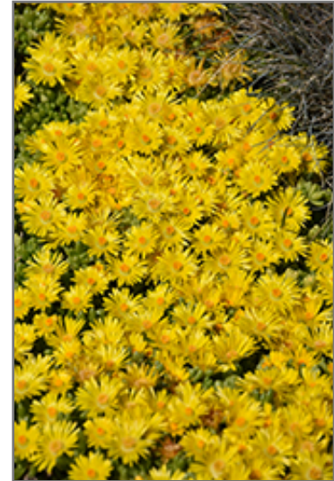
Yellow Ice Plant flowers

Yellow Ice Plant is recommended for the following landscape applications;