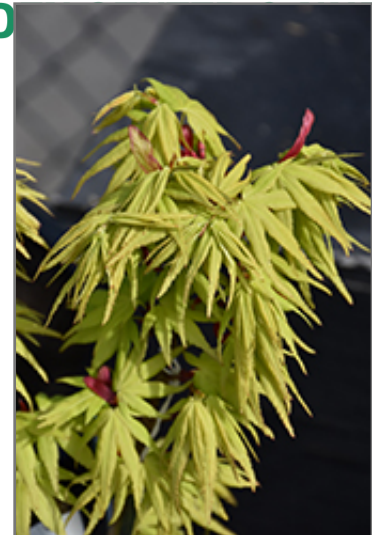
Mikawa Yatsubusa Japanese Maple foliage