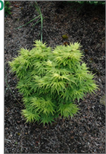
Mikawa Yatsubusa Japanese Maple

Mikawa Yatsubusa Japanese Maple is a fine choice for the yard, but it is also a good selection for planting in outdoor pots and containers. With its upright habit of growth, it is best suited for use as a 'thriller' in the 'spiller-thriller-filler' container combination; plant it near the center of the pot, surrounded by smaller plants and those that spill over the edges. It is even sizeable enough that it can be grown alone in a suitable container. Note that when grown in a container, it may not perform exactly as indicated on the tag - this is to be expected. Also note that when growing plants in outdoor containers and baskets, they may require more frequent waterings than they would in the yard or garden.