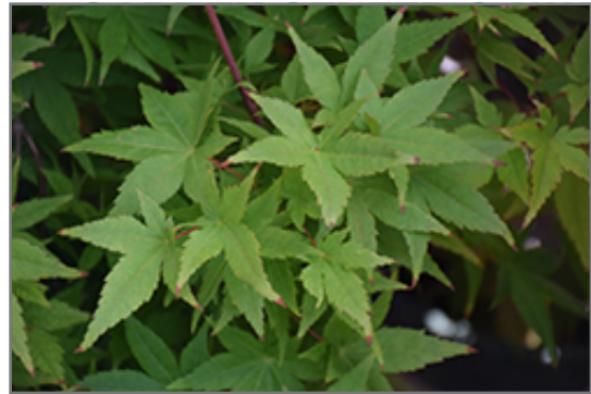
Ryusen Japanese Maple foliage

Ryusen Japanese Maple will grow to be about 10 feet tall at maturity, with a spread of 10 feet. It tends to be a little leggy, with a typical clearance of 2 feet from the ground, and is suitable for planting under power lines. It grows at a slow rate, and under ideal conditions can be expected to live for 60 years or more.