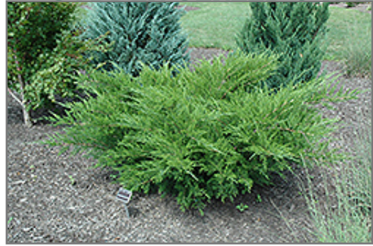
Sea Green Juniper

Sea Green Juniper will grow to be about 4 feet tall at maturity, with a spread of 6 feet. It tends to fill out right to the ground and therefore doesn't necessarily require facer plants in front. It grows at a slow rate, and under ideal conditions can be expected to live for approximately 30 years.