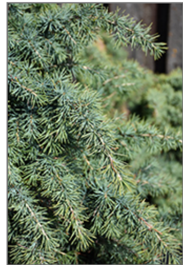
Divinely Blue Deodar Cedar foliage