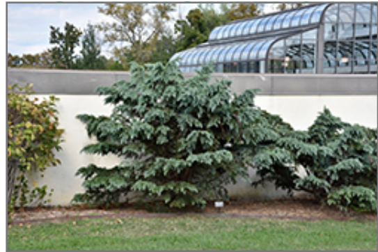
Divinely Blue Deodar Cedar

Divinely Blue Deodar Cedar will grow to be about 6 feet tall at maturity, with a spread of 6 feet. It has a low canopy with a typical clearance of 1 foot from the ground, and is suitable for planting under power lines. It grows at a slow rate, and under ideal conditions can be expected to live for 50 years or more.