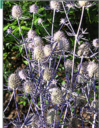
Jade Frost Variegated Sea Holly flowers

Jade Frost Variegated Sea Holly is a fine choice for the garden, but it is also a good selection for planting in outdoor pots and containers. It can be used either as 'filler' or as a 'thriller' in the 'spiller-thriller-filler' container combination, depending on the height and form of the other plants used in the container planting. Note that when growing plants in outdoor containers and baskets, they may require more frequent waterings than they would in the yard or garden.