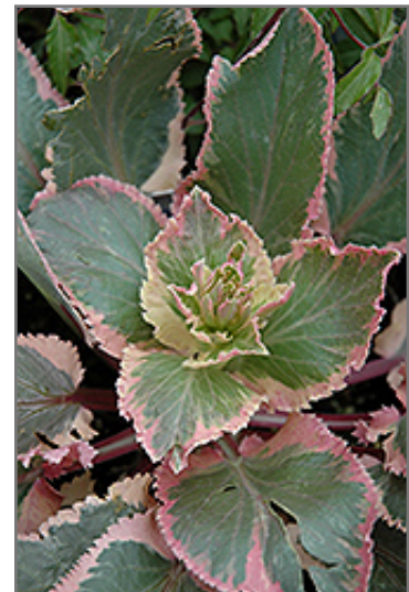
Jade Frost Variegated Sea Holly foliage