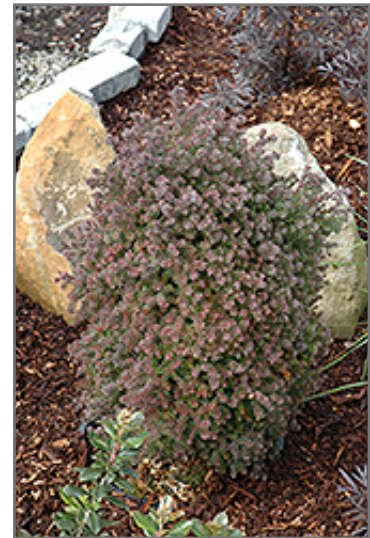
Red Star Whitecedar