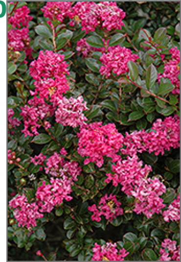
Pocomoke Crape Myrtle flowers