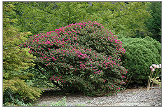
Pocomoke Crape Myrtle in bloom