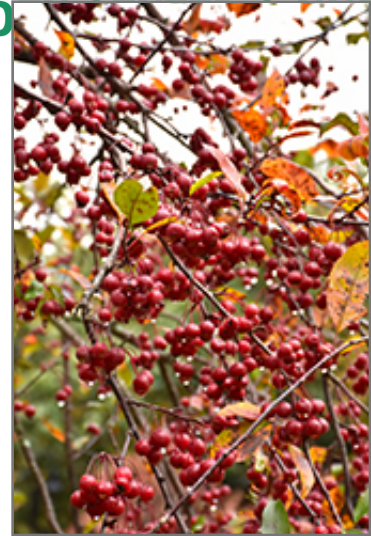
Prairifire Flowering Crab fruit

This tree should only be grown in full sunlight. It prefers to grow in average to moist conditions, and shouldn't be allowed to dry out. It is not particular as to soil type or pH. It is highly tolerant of urban pollution and will even thrive in inner city environments. This particular variety is an interspecific hybrid.