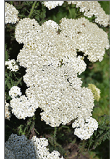
Firefly Diamond Yarrow flowers

Firefly Diamond Yarrow is recommended for the following landscape applications;