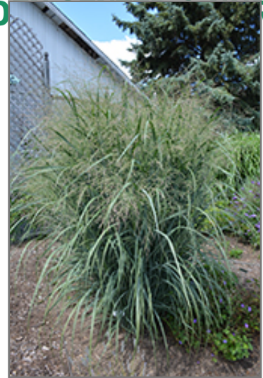
Northwind Switch Grass in bloom

This plant does best in full sun to partial shade. It is very adaptable to both dry and moist locations, and should do just fine under typical garden conditions. It is considered to be drought-tolerant, and thus makes an ideal choice for a low-water garden or xeriscape application. It is not particular as to soil type, but has a definite preference for alkaline soils, and is able to handle environmental salt. It is somewhat tolerant of urban pollution. This is a selection of a native North American species. It can be propagated by division; however, as a cultivated variety, be aware that it may be subject to certain restrictions or prohibitions on propagation.