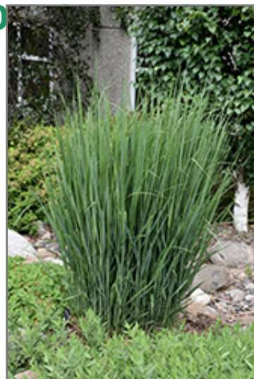
Northwind Switch Grass

Northwind Switch Grass will grow to be about 4 feet tall at maturity, with a spread of 3 feet. It tends to be leggy, with a typical clearance of 1 foot from the ground, and should be underplanted with lower-growing perennials. It grows at a medium rate, and under ideal conditions can be expected to live for approximately 15 years. As an herbaceous perennial, this plant will usually die back to the crown each winter, and will regrow from the base each spring. Be careful not to disturb the crown in late winter when it may not be readily seen!