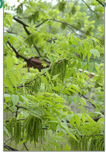
Pecan flowers

This tree is typically grown in a designated area of the yard because of its mature size and spread. It does best in full sun to partial shade. It is very adaptable to both dry and moist locations, and should do just fine under average home landscape conditions. It is not particular as to soil pH, but grows best in rich soils. It is somewhat tolerant of urban pollution. This species is native to parts of North America.