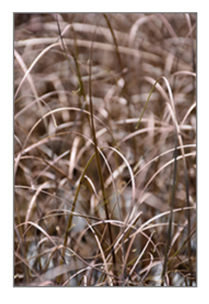
Cappuccino Hair Sedge foliage