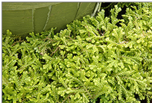
Golden Spikemoss foliage