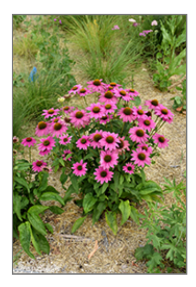
PowWow Wild Berry Coneflower in bloom

This is a relatively low maintenance plant, and is best cleaned up in early spring before it resumes active growth for the season. It is a good choice for attracting birds and butterflies to your yard, but is not particularly attractive to deer who tend to leave it alone in favor of tastier treats. It has no significant negative characteristics.