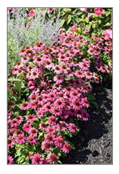
PowWow Wild Berry Coneflower in bloom