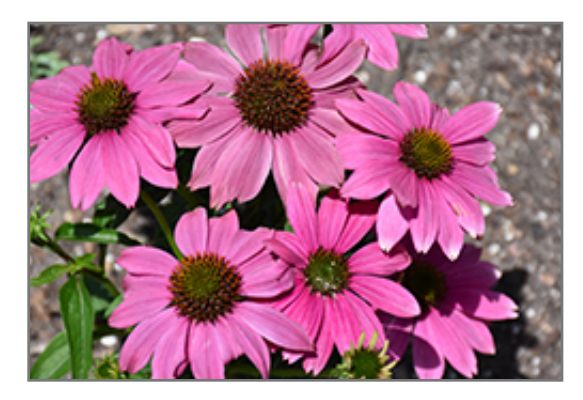
PowWow Wild Berry Coneflower flowers

11035 York Road Cockeysville, MD 21030 410.527.0700 www.valleyviewfarms.com www.facebook.com/ValleyViewFarms