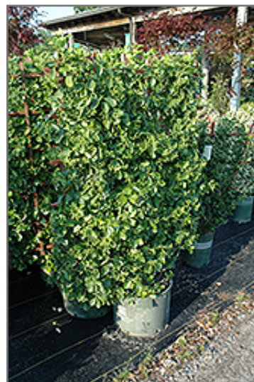
Manhattan Spreading Euonymus