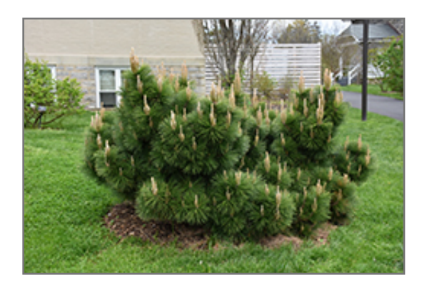
Thunderhead Japanese Black Pine

Thunderhead Japanese Black Pine is recommended for the following landscape applications;