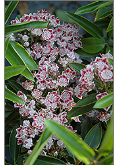
Carousel Mountain Laurel flowers

Carousel Mountain Laurel will grow to be about 10 feet tall at maturity, with a spread of 10 feet. It has a low canopy with a typical clearance of 1 foot from the ground, and is suitable for planting under power lines. It grows at a slow rate, and under ideal conditions can be expected to live for 50 years or more.