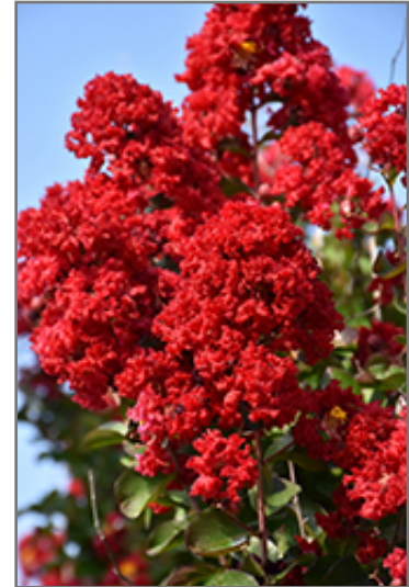
Dynamite Crapemyrtle flowers