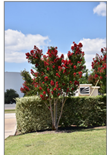
Dynamite Crapemyrtle in bloom