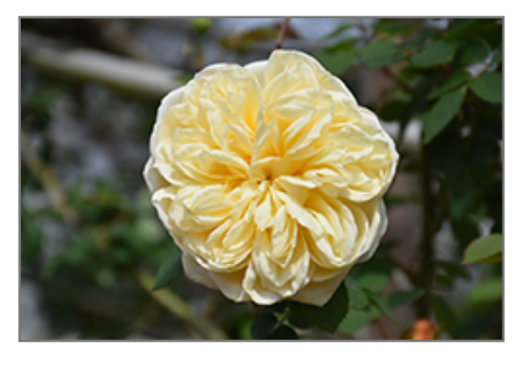
Teasing Georgia Rose flowers

11035 York Road Cockeysville, MD 21030 410.527.0700 www.valleyviewfarms.com www.facebook.com/ValleyViewFarms