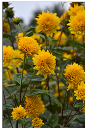
Sunshine Daydream Sunflower flowers

Sunshine Daydream Sunflower is recommended for the following landscape applications;