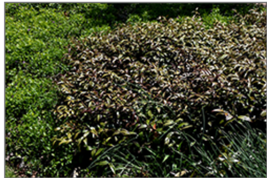
Scarletta Fetterbush