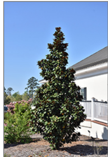
Teddy Bear Magnolia