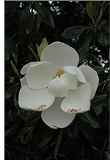
Teddy Bear Magnolia flowers