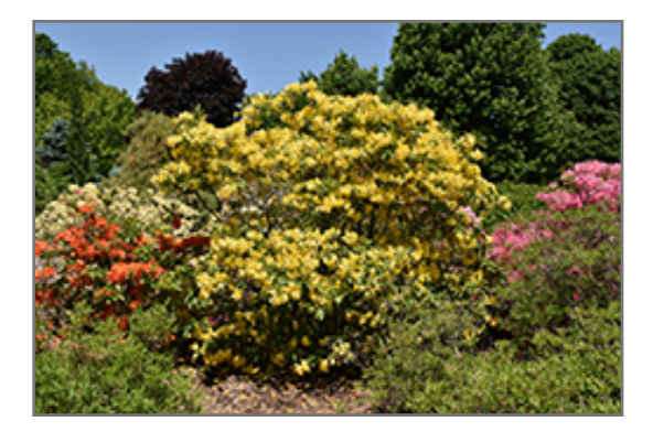
Lemon Lights Azalea in bloom