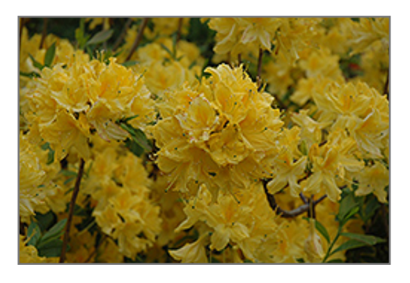
Lemon Lights Azalea flowers