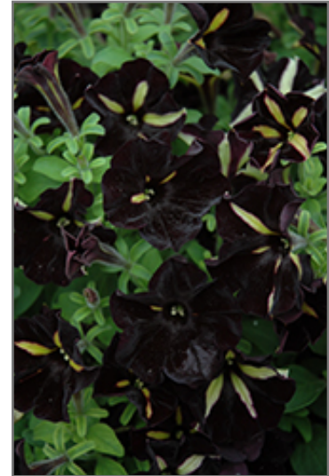
Phantom Petunia flowers