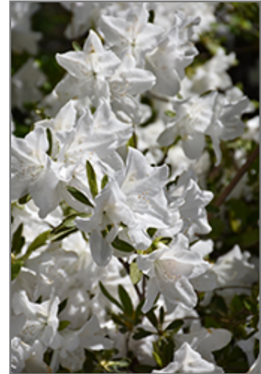
Weston's Innocence Rhododendron flowers

Weston's Innocence Rhododendron will grow to be about 4 feet tall at maturity, with a spread of 4 feet. It tends to be a little leggy, with a typical clearance of 1 foot from the ground. It grows at a slow rate, and under ideal conditions can be expected to live for 40 years or more.