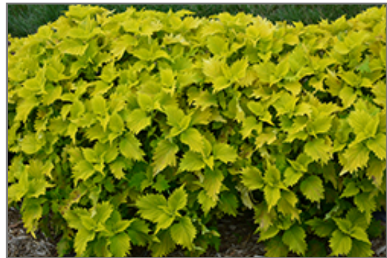
Wasabi Coleus