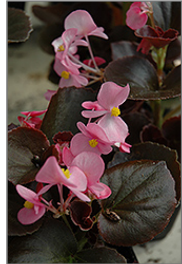
Cocktail Gin Begonia flowers