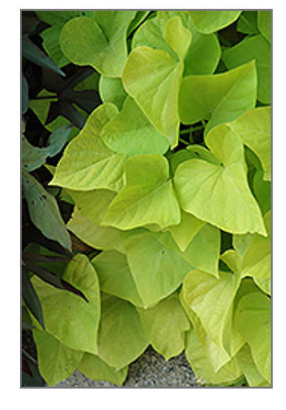
Marguerite Sweet Potato Vine foliage

Marguerite Sweet Potato Vine will grow to be only 6 inches tall at maturity, with a spread of 3 feet. Its foliage tends to remain low and dense right to the ground. This fast-growing annual will normally live for one full growing season, needing replacement the following year.