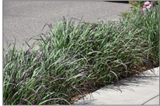
Ruby Ribbons Switch Grass

Ruby Ribbons Switch Grass will grow to be about 3 feet tall at maturity extending to 4 feet tall with the flowers, with a spread of 30 inches. It tends to be leggy, with a typical clearance of 1 foot from the ground, and should be underplanted with lower-growing perennials. It grows at a medium rate, and under ideal conditions can be expected to live for approximately 15 years. As an herbaceous perennial, this plant will usually die back to the crown each winter, and will regrow from the base each spring. Be careful not to disturb the crown in late winter when it may not be readily seen!