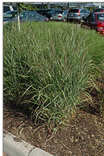
Ruby Ribbons Switch Grass

Ruby Ribbons Switch Grass is recommended for the following landscape applications;