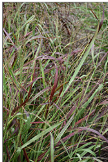
Ruby Ribbons Switch Grass foliage