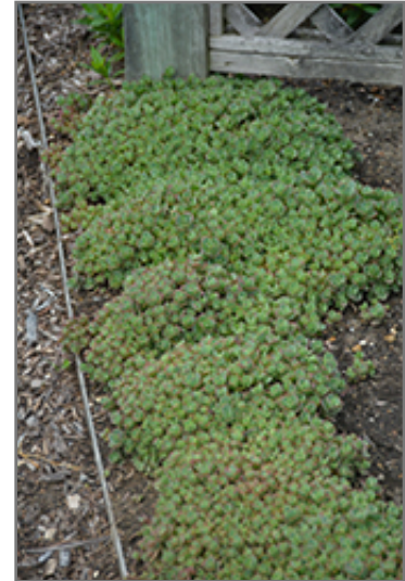
Lime Zinger Stonecrop

Lime Zinger Stonecrop will grow to be only 4 inches tall at maturity extending to 6 inches tall with the flowers, with a spread of 18 inches. When grown in masses or used as a bedding plant, individual plants should be spaced approximately 15 inches apart. Its foliage tends to remain low and dense right to the ground. It grows at a fast rate, and under ideal conditions can be expected to live for approximately 15 years. As an herbaceous perennial, this plant will usually die back to the crown each winter, and will regrow from the base each spring. Be careful not to disturb the crown in late winter when it may not be readily seen!