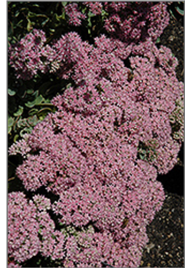
Lime Zinger Stonecrop flowers

This is a relatively low maintenance plant, and is best cleaned up in early spring before it resumes active growth for the season. It is a good choice for attracting bees and butterflies to your yard, but is not particularly attractive to deer who tend to leave it alone in favor of tastier treats. It has no significant negative characteristics.