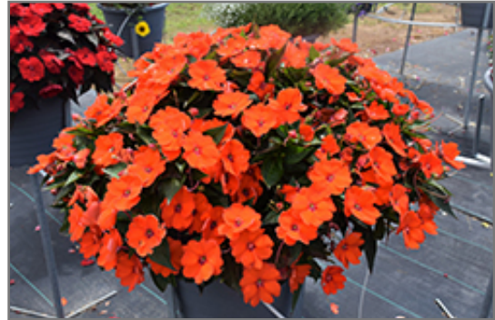
SunPatiens Compact Electric Orange New Guinea Impatiens in bloom

SunPatiens Compact Electric Orange New Guinea Impatiens is a fine choice for the garden, but it is also a good selection for planting in outdoor containers and hanging baskets. It can be used either as 'filler' or as a 'thriller' in the 'spiller-thriller-filler' container combination, depending on the height and form of the other plants used in the container planting. It is even sizeable enough that it can be grown alone in a suitable container. Note that when growing plants in outdoor containers and baskets, they may require more frequent waterings than they would in the yard or garden.