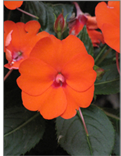
SunPatiens Compact Electric Orange New Guinea Impatiens flowers

This plant will require occasional maintenance and upkeep, and should not require much pruning, except when necessary, such as to remove dieback. It is a good choice for attracting bees and butterflies to your yard. It has no significant negative characteristics.