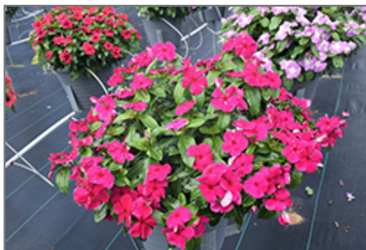
Titan Burgundy Vinca in bloom