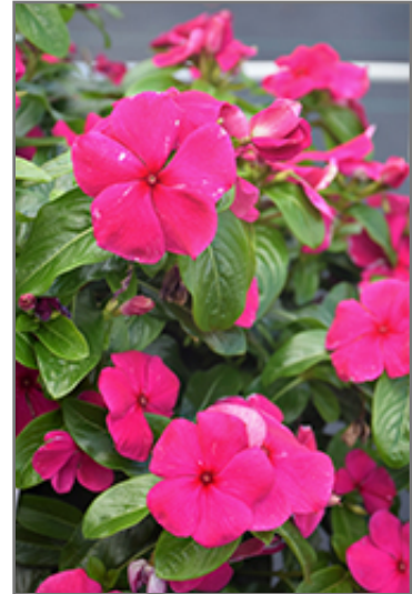
Titan Burgundy Vinca flowers

Titan Burgundy Vinca is a fine choice for the garden, but it is also a good selection for planting in outdoor containers and hanging baskets. It is often used as a 'filler' in the 'spiller-thriller-filler' container combination, providing a mass of flowers against which the thriller plants stand out. Note that when growing plants in outdoor containers and baskets, they may require more frequent waterings than they would in the yard or garden.