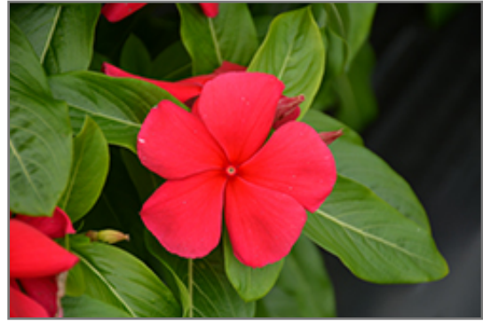
Titan Dark Red Vinca flowers

Titan Dark Red Vinca is recommended for the following landscape applications;