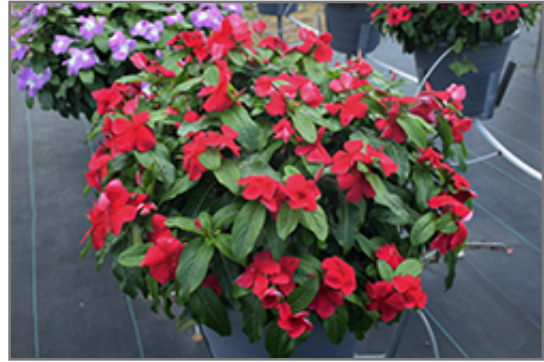
Titan Dark Red Vinca in bloom

Titan Dark Red Vinca will grow to be about 14 inches tall at maturity, with a spread of 12 inches. Its foliage tends to remain dense right to the ground, not requiring facer plants in front. Although it's not a true annual, this fast-growing plant can be expected to behave as an annual in our climate if left outdoors over the winter, usually needing replacement the following year. As such, gardeners should take into consideration that it will perform differently than it would in its native habitat.